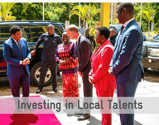
Investing in Local Talents

ACHIEVING MORE TOGETHER WITH OUR LOCAL PARTNERS.