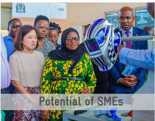
Potential of SMEs