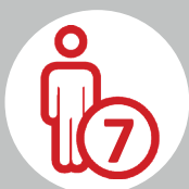
Seven Partner States